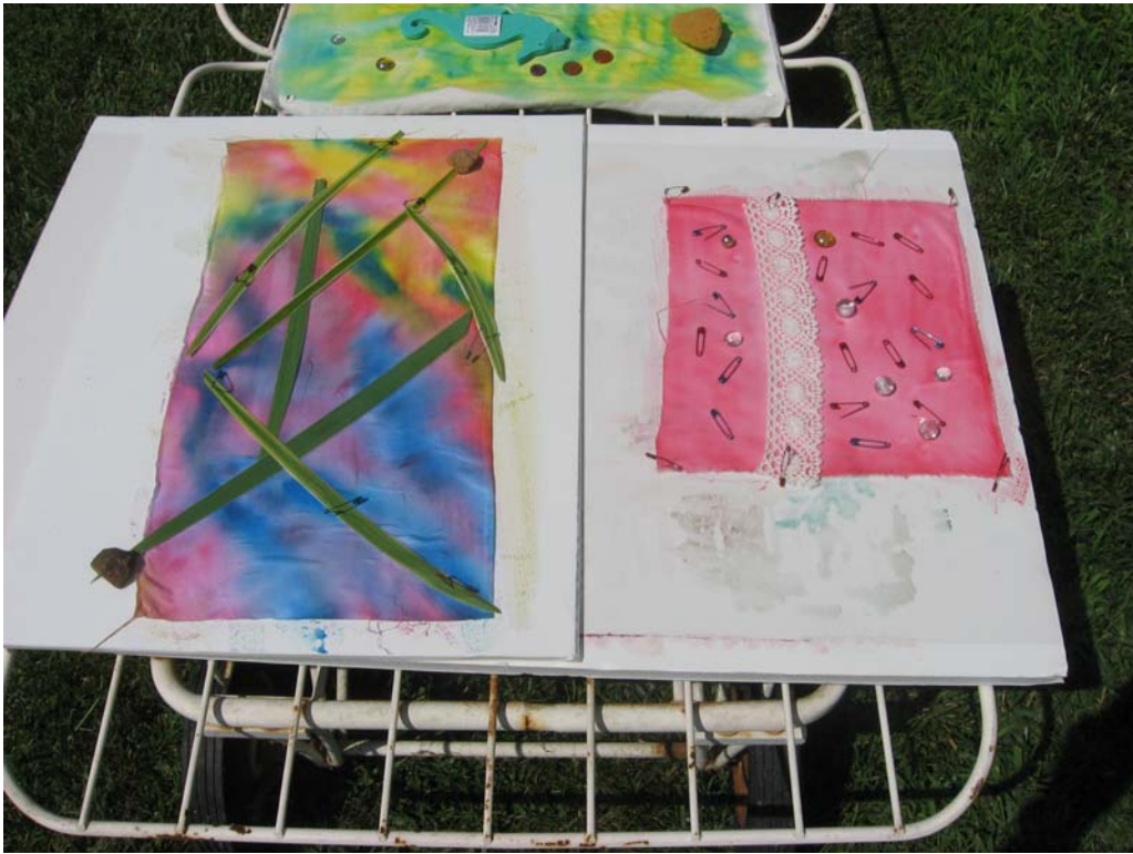
Janice Lauderdale placed leaves on hers and Maureen Ashlock used safety pins and lace.