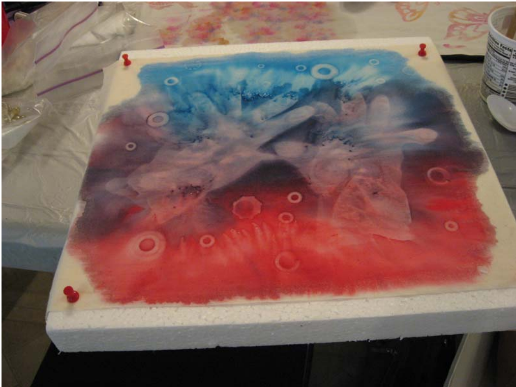
Eleanor Bronnenberg not only used washers, she found a new use for those old surgical gloves.