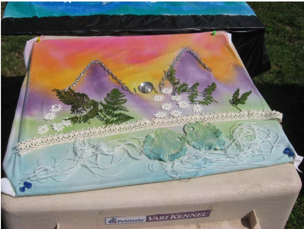
Cher Piche painted mountains and placed fern leaves, chain, dollies, and a few other objects for the sun to play with.